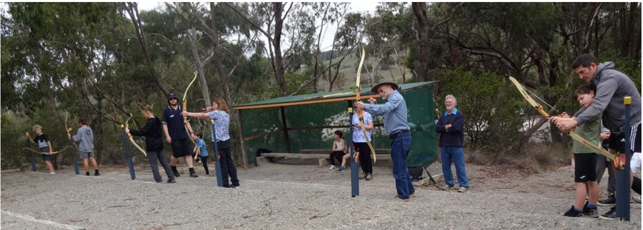
Archery activity at the 2019 community camp