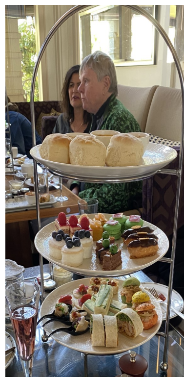
Women's Wisdom –April 2021

Notwithstanding the disruption caused by COVID-19, the HFACT Committee continued to operate through virtual meetings. The Counsellor also continued to schedule meetings, making the most to serve the community while meeting public health requirements.