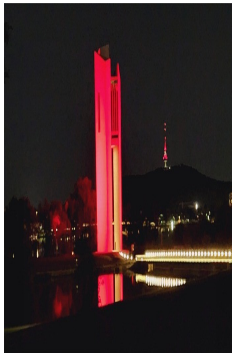
Carillon lit up for World Haemophilia Day -17 April 2022